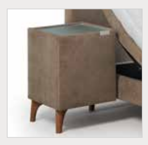
Focus night table 40x40x45cm